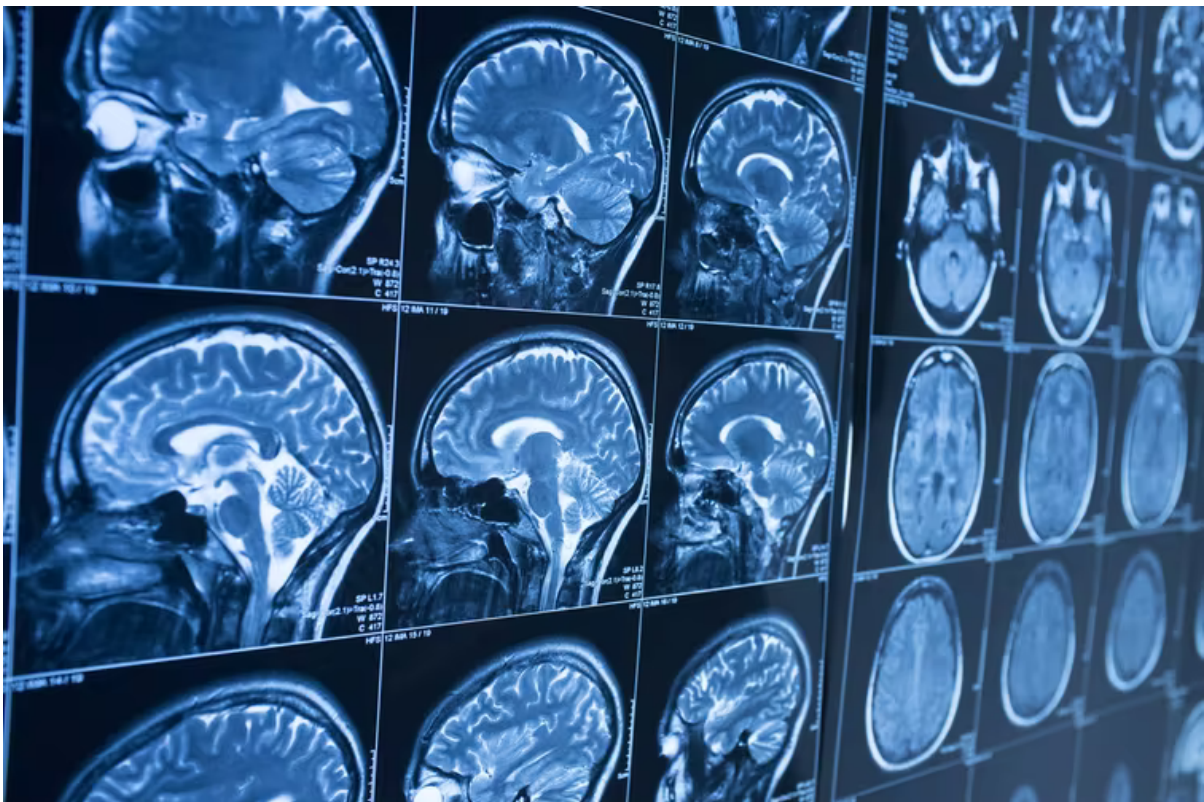
Human brain structure is the same in males and females.

Computers can do this with 80% to 90% accuracy except, once again, this accuracy falls to 60% (or not much better than a coin flip) when you properly control for head size. More troublesome is that these algorithms don't translate across populations, such as European versus Chinese. Such inconsistency shows there are no universal features that discriminate male and female brains in humans – unlike those deer antlers.